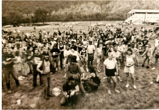
1990—State Party in Cumberland, MD